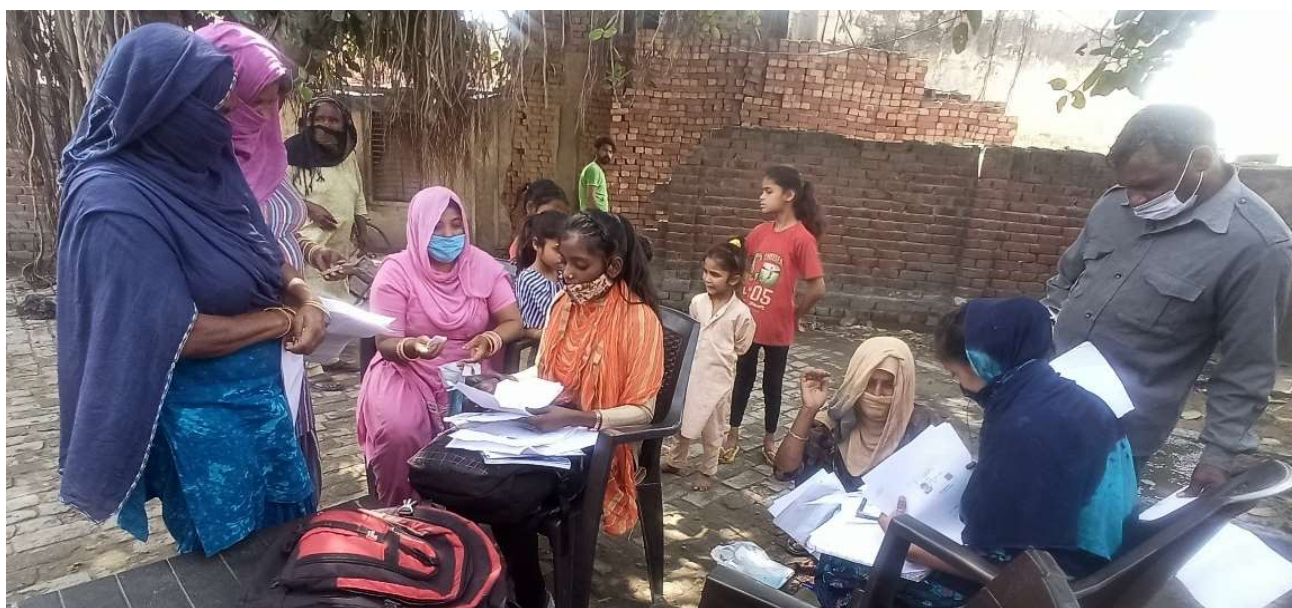
Community Mobilizers assisting the villagers in filling up forms and other documentation process, to avail the scheme benefits