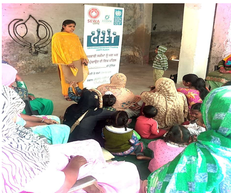
Awareness session with village women, in progress

One of the many challenges encountered by underprivileged communities in India is availing the